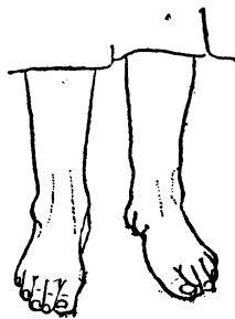
FIG. 2.—Drawing from a photograph.

applying to the foot a liniment of great promise but defective performance. When seen four months later, the left foot was valgoid, and the forefoot displaced outward; the internal cuneiform bone was very prominent; there was a general stiffness of the foot, and movements were painful. A skiagram showed dislocation at the tarso-metatarsal joint outward and slightly dorsal, with considerable bone atrophy. She was ordered a light outside steel to the knee, valgus T-strap, and a surgical boot wedged on the inner side. A month later function was good.