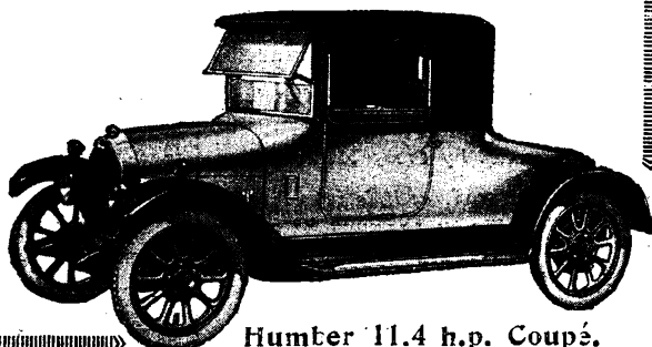
Humber 11.4 h.p. Coupé.

CITY SHOWROOMS, 32, Holborn Viaduct, E.C. 1. Tel. Holborn 166. Tel. "Humber, London." WEST END SHOWROOMS, Humber House, 94, New Bond St., W. 1. Tel. Regent 2983. Tel. "Humbertie, Wesdo, London."