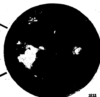
Ophthalmoscope Record: Diabetic Retinitis.

This instrument is a modified form of the design due to the late Prof. Wertheim Salomonson. By its means it is possible to obtain photographs of the fundus, about 44 mm. in diameter, covering a large proportion of the total fundus and enabling both the disc and yellow spot to be shown on one plate.