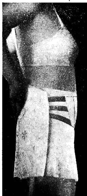
Spencer Supporting Corset shown open, revealing inner abdominal section.

Visceroptosis — Hernia Post-operative Conditions