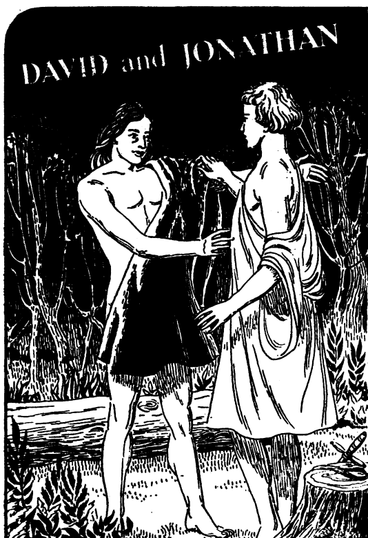
The shepherd boy and the King's son who made a covenant and became as brothers have remained symbols of undying friendship down the ages.

The soul of Jonathan was knit with the soul of David—they were history's first and most famous inseparable friends.