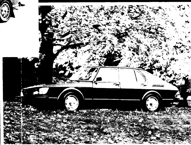
Saab 900 5 door GLs