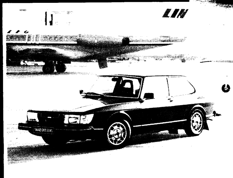
Saab 900 3 door EMS