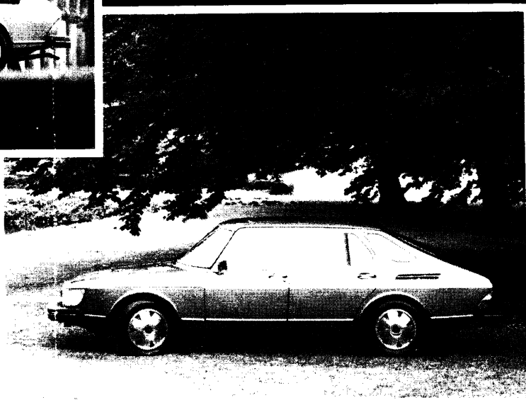
Saab 900 5 door GLE