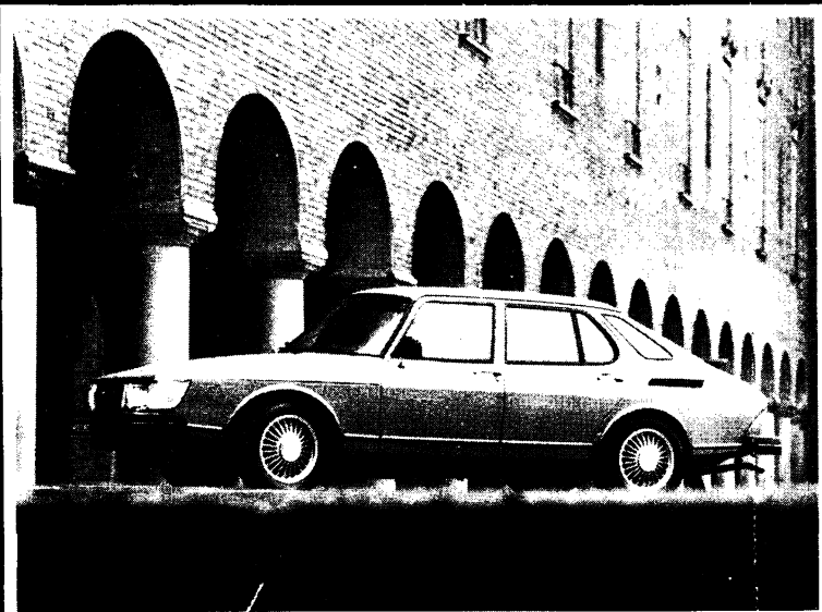
Saab 900 5 door Turbo