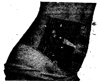
Sectional View showing Spring in position on Inner Pad.