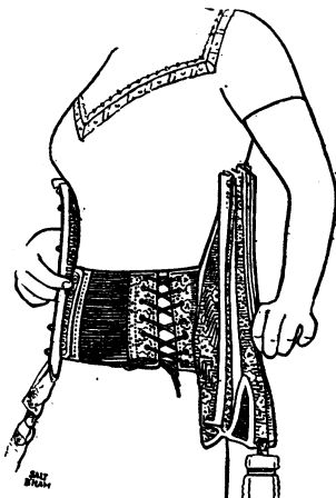
Side view with Belt fastened.

Write for Particulars and Measurement Forms.