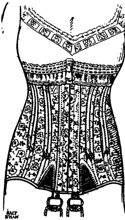
Corset finally fastened. Belt in Position under Corsets.