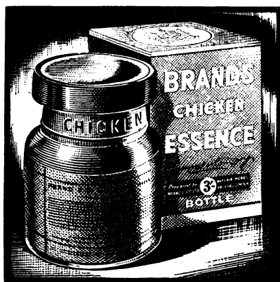
Brand's Essence is still at pre-war prices.

There are three methods of stimulating the metabolic rate in patients suffering from depressed metabolism: