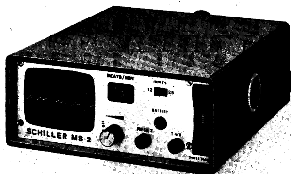
Electrocardioscope and pulse reading instrument. Displays results within a second, reads at a glance. A featherweight of 650 g.

Schiller's mini ECG and ECS are meeting a widely felt demand in hospitals as well as in private practice, in emergency wards, during home visits and in ambulances. The electrode tripod at the back of the instruments is applied directly to the thorax and permits instant diagnosis. In addition, all classical derivations are possible by means of a five-core cable.