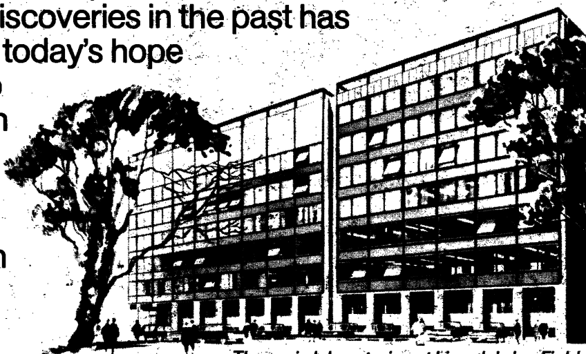
The main laboratories at Lincoln's Inn Fields

From our discoveries in the past has come much of today's hope for sufferers. To go forward with our research for future alleviation, we ask your help in the present.