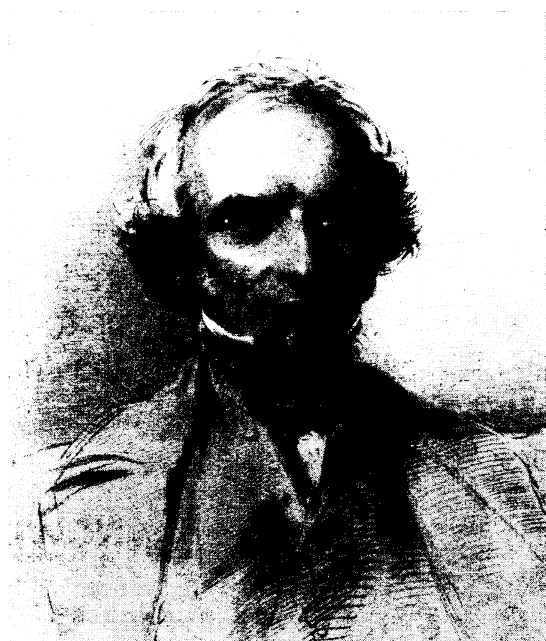
Peter Mere Latham

Major Greenwood, the first professor of epidemiology and statistics at the London School of Hygiene and Tropical Medicine, was in many ways as remarkable as those he commemorated. In the introduction to this Keynes Press edition Sir Austin Bradford Hill, who knew him well, provides a fascinating portrait as well as examining the significance of Greenwood's career.