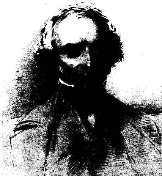
Peter Mere Latham

Major Greenwood, the first professor of epidemiology and statistics at the London School of Hygiene and Tropical Medicine, was in many ways as remarkable as those he commemorated. In the introduction to this Keynes Press edition Sir Austin Bradford Hill, who knew him well, provides a fascinating portrait as well as examining the significance of Greenwood's career.