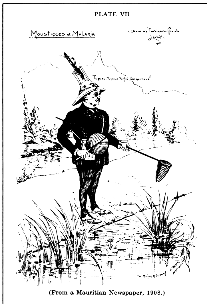
(From a Mauritian Newspaper, 1908.)

Order from: British Medical Journal (Keynes Press) PO Box 295, London WC1H 9TE