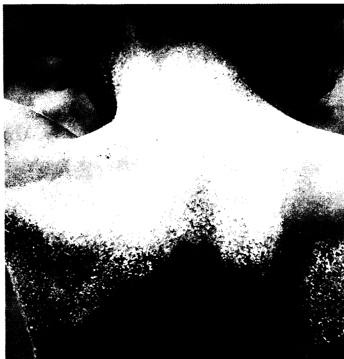
Dermatophytosis caused by Trichophyton concentricum

Fungi have a strong affinity for the lipid-rich layers of the skin, the mucosa and other tissues. In addition, fungal cell membranes consist largely of lipids.