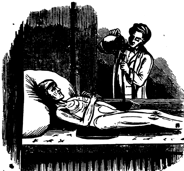
CUSHION FOR GENERAL PURPOSES.

ASTHENIC GANGRENE, BEDSORES, CANCER, CHOLERA, COLDNESS OF THE BODY, CONSUMPTIVE CASES, DISEASED JOINTS, DROPSY, FEVERS, FRACTURES, GOUT,