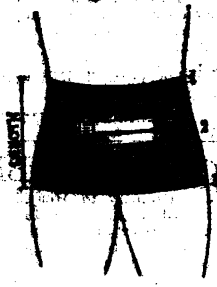
Fig. 1. THE BELT AND AIR-PAD FOR FEMORAL HERNIA.—Mr. BOURJEAUD has to state that this has been extensively tried, and has met with great approbation, especially at Guy's and St. Bartholomew's Hospitals. (See Lancet , January 10, 1886, p. 43; and March 13, 1886, p. 367.)

Fig. 2. APPARATUS FOR UMBILICAL HERNIA.—Mr. BOURJEAUD has had several cases of radical cure with young subjects. (See Lancet , July 12th, 1881, page 55; and Feb. 12th, 1886, page 186.)