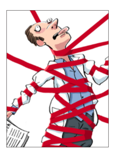
Regulation of clinical research, p 1085