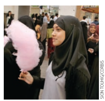
Prevention of type 2 diabetes in British Bangladeshis, p 1094