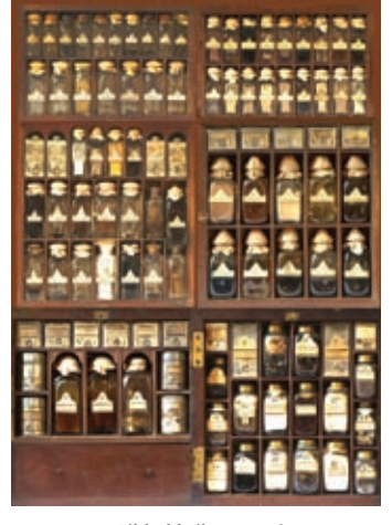
Sibbald Library project, p 1072