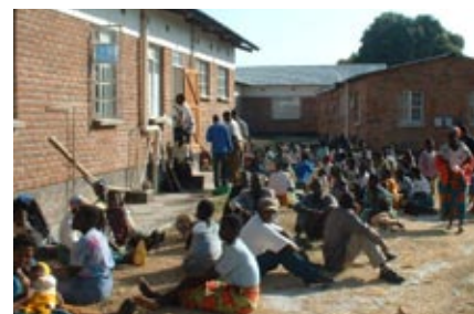
Personal view, p 54