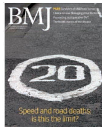
Editorials, p 1 Research, p 31