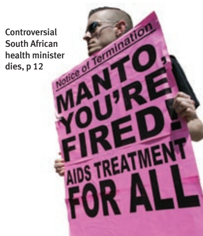
Controversial South African health minister dies, p 12