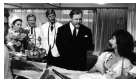
Widening access to medicine, p 13