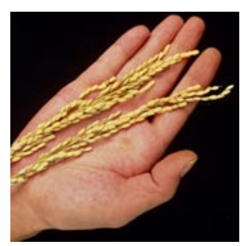
Rising global food prices, p 269