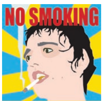
NHS review praises smoking ban, p 827