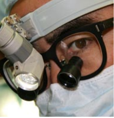
Great Ormond Street on BBC2, p 870