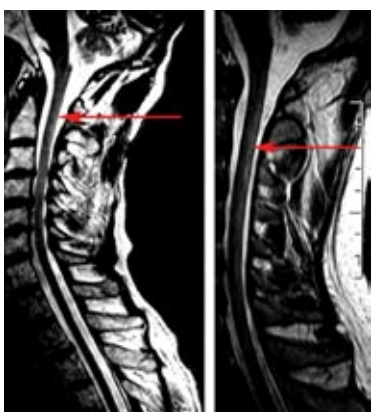
Copper deficiency and balance, p 864