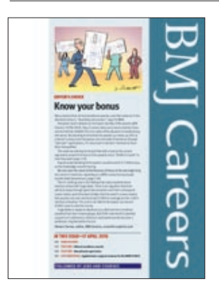
Career Focus, jobs, and courses appear after p 872