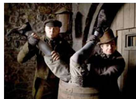
Murdering for anatomy, p 997