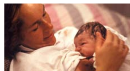
Home births? pp 950, 962, 981