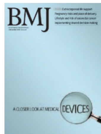
Feature, p 966, Editorial, p 947