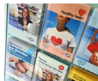
Patient choice, pp 948, 971, 973