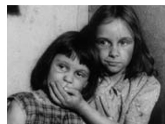
Healthcare in documentary films, p 969