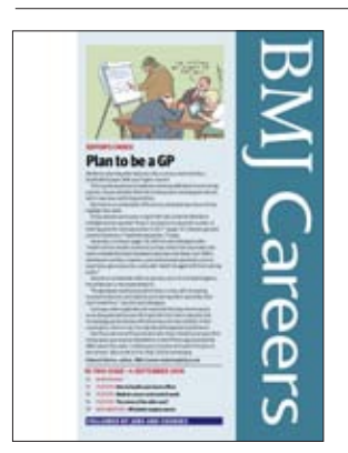
Career Focus, jobs, and courses appear after p 510

○ Twitter Follow the editor Fiona Godlee, at twitter.com/ fgodlee and the BMJ's latest at twitter.com/bmj_latest