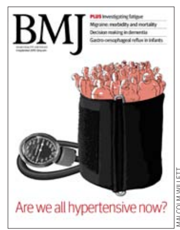
Feature, p 484