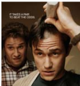
Surviving cancer in film, p 1261