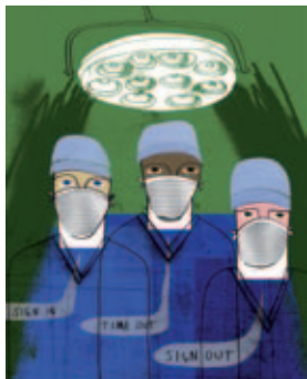
Follow surgical checklists, p 37