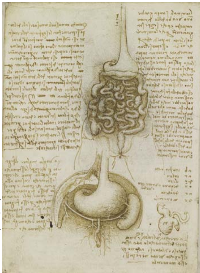
THE ROYAL COLLECTION/HER MAJESTY QUEEN ELIZABETH II

Published weekly. US periodicals class postage paid at Rahway, NJ. Postmaster: send address changes to BMJ , c/o Mercury Airfreight International Ltd Inc, 365 Blair Road, Avenel, NJ 07001, USA. $796. Weekly