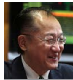
Jim Yong Kim, p 22