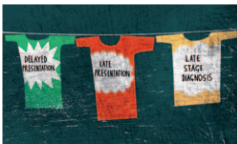
A call for consistency in cancer terminology, p 32