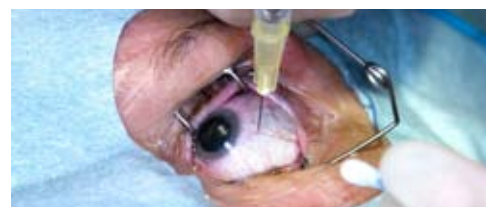
Intraocular ranibizumab injection, p 24

Articles appearing in this print journal have already been published on bmj.com , and the version in print may have been shortened. bmj.com also contains material that is supplementary to articles: this will be indicated in the text (references are given as w1, w2, etc) and be labelled as extra on bmj.com .