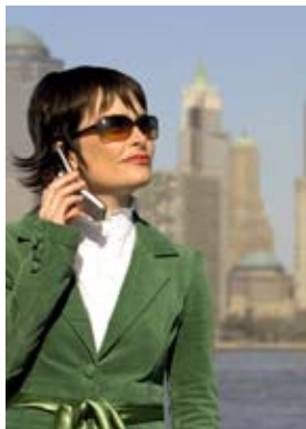
Are mobiles safe? p 27