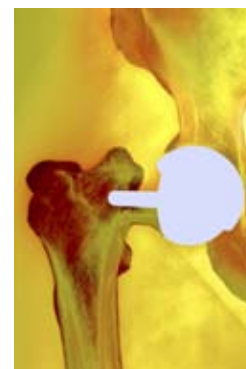
Hip replacement, p 9