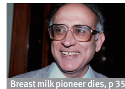
Breast milk pioneer dies, p 35