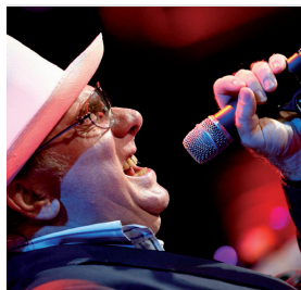
Van Morrison's medical classic, p 34