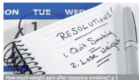
How much weight gain after stopping smoking? p 5