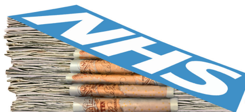
Why some patients are paying for NHS services, p 20