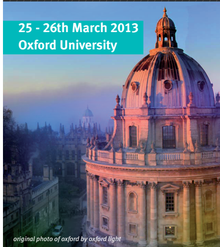
original photo of oxford by oxford light