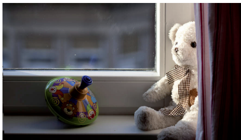
Giving dying children a voice, p 33