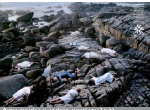
Organ donation campaigns: over the top? p 33

Sonata for viola and piano (opus 147) by Dmitri Shostakovich Desmond O'Neill