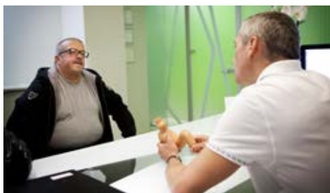
Report urges GPs to be frank with patients about weight, p 3