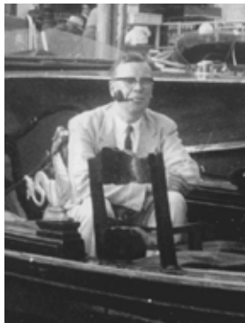
Former Lancet editor, p 27