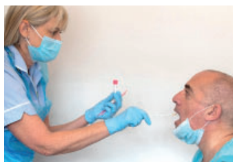
Impact of covid-19 vaccination in healthcare workers p 144