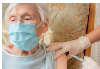
Effectiveness of a fourth covid-19 vaccine dose against the omicron variant p 143