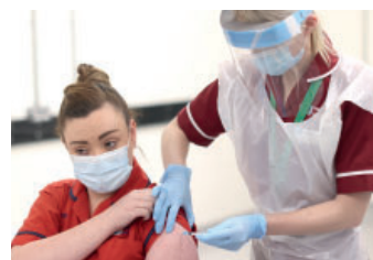
Effectiveness of different covid-19 vaccines in health and social care workers p 146